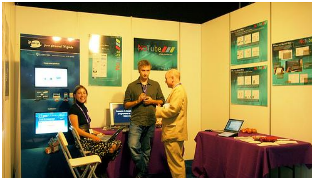
NoTube at the IBC 2010 New Technology Campus.