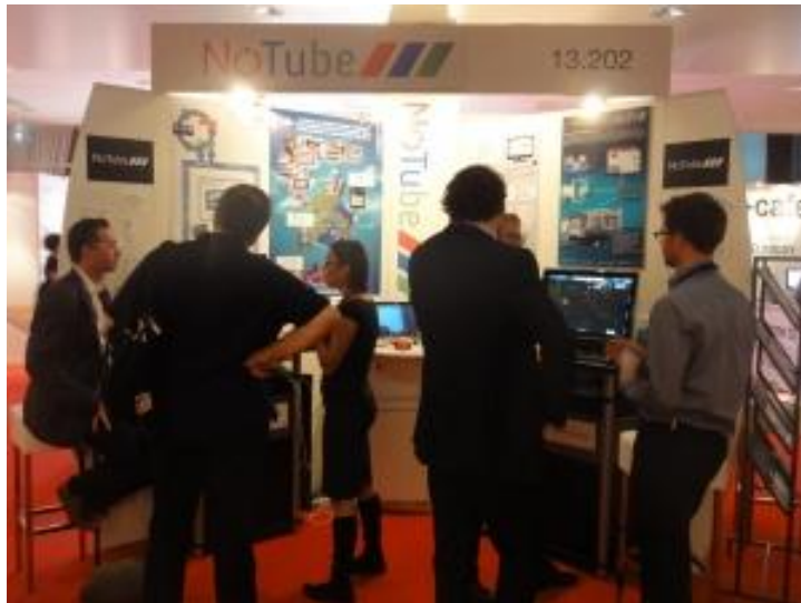
Above: photo of our IBC 2011 stand