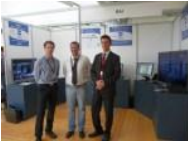
Above: NoTube stand at NEM Summit 2011